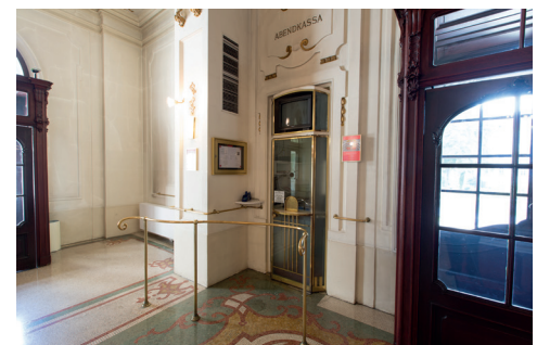
Evening box office