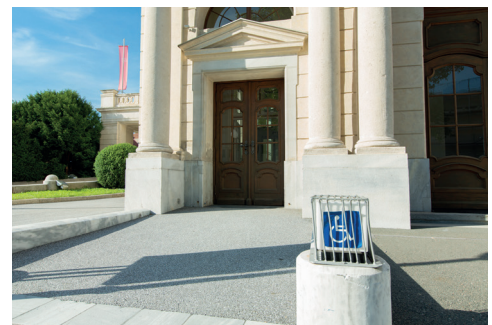
Accessible side entrance