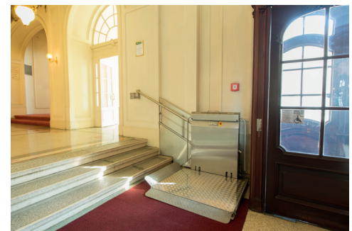
Steps and stair lift