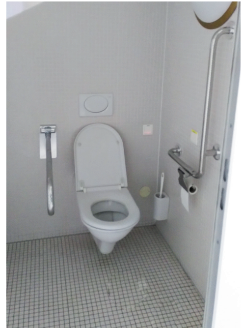
Accessible men's toilet (without description)